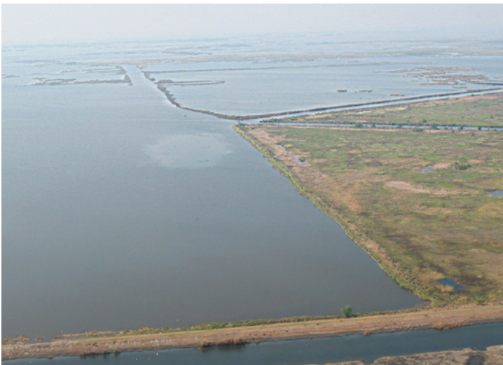
Aerial view of project area looking west with the parish levee in the foreground and adjacent to the completed BA-39 project

Wetlands in the Barataria Basin were historically nourished by the fresh water, sediment and nutrients delivered by the Mississippi River and its many distributary channels. These sediment and nutrient inputs ceased following the creation of levees along the lower river for flood control and navigation. In addition, the construction of numerous oil and gas canals along with subsurface oil and gas withdrawal has exacerbated wetland loss in the area. From 1932 to 1990, the Barataria Basin lost over 245,000 acres of marsh. From 1978 to 1990, the area experienced the highest rate of wetland loss in coastal Louisiana.