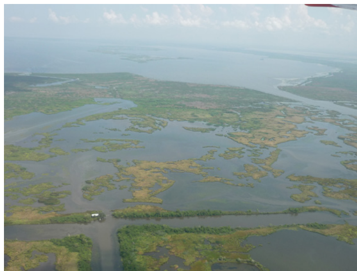
A view of the western fill area from south to north. The project will fill the open water and nourish the existing marsh north of the oil/gas canal. The solid marsh areas in the background were created as part of the BA-36 Dedicated Dredging on the Barataria Basin Landbridge Project.

The project will work synergistically with several existing and planned projects on the Barataria Basin Landbridge, an important landscape feature across the central Barataria Basin.