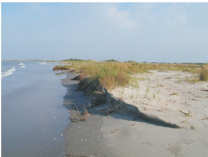
This project will help to stabilize the eroding barrier shoreline, which is shown above.

A large shoreline breach developed early in 2003 after the passage of Hurricane Lili in October 2002. The gulfside erosion rate is approximately 13 feet per year. It is expected that the shoreline erosion rates and percent loss per year have increased since the passage of Hurricane Lili in 2002 and the relatively high frequency of tropical storms in 2003. Wetlands, dune, and swale habitats within the project area have undergone substantial loss due to oil and gas activities (e.g., pipeline construction), subsidence, sea level rise, and marine- and wind-induced erosion causing landward transgression and, more recently, breaching and breakup.