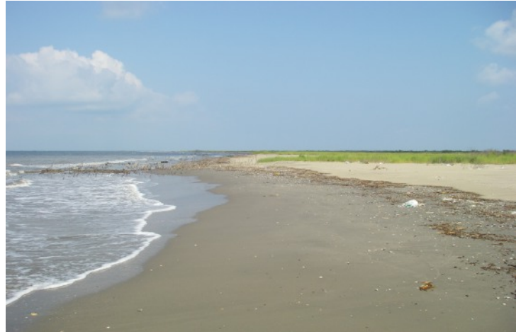
This is a picture of the vulnerable western Caminada headland.

This project will reestablish the West Belle headland by rebuilding a large portion of the beach, dune, and back barrier marsh that once existed. Approximately 9,800 feet of beach and dune will be rebuilt using nearly 2.8 million cubic yards of dredged sand, and 150 acres of marsh habitat will be rebuilt using nearly 1.4 million cubic yards of dredged material. Native vegetation will be planted upon construction to help stabilize the rebuilt marsh and dune habitat.