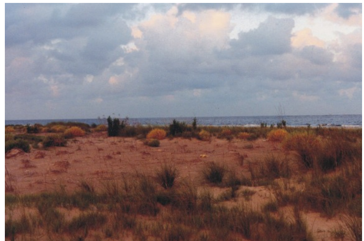
Barrier island habitat such as this will be restored with this project.

For more project information, please contact: