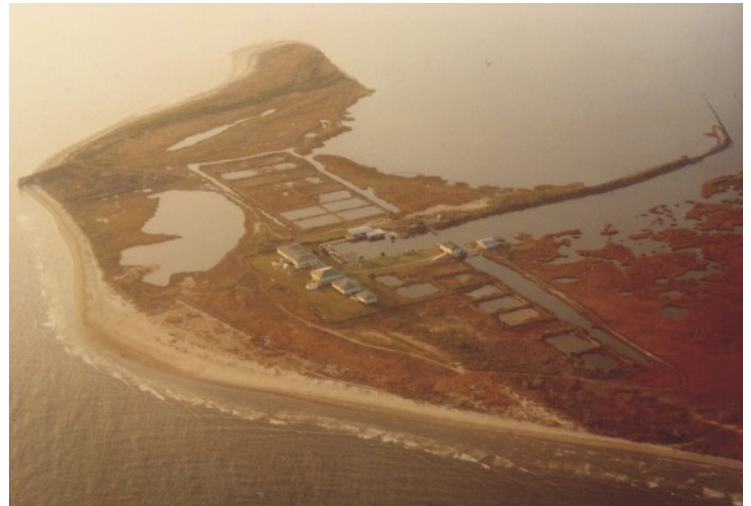
Aerial view of the Lyle S. St. Amant Marine Biological Laboratory on west Grand Terre Island.

This project is listed on Priority Project List 9.