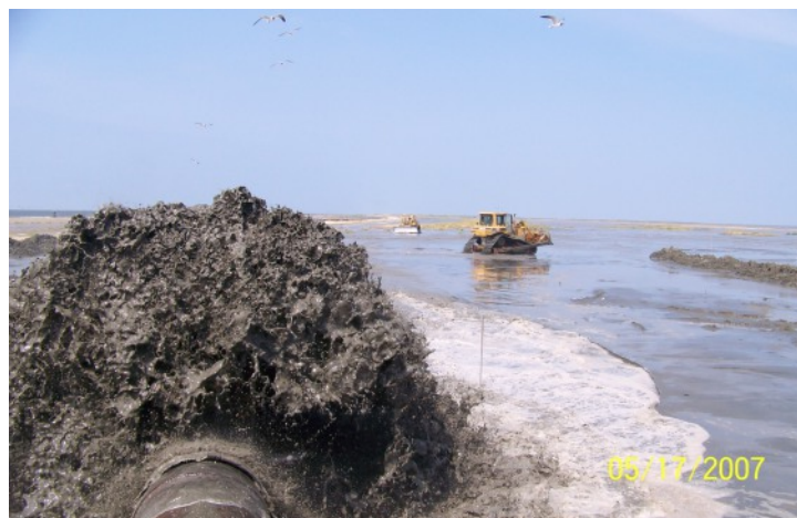
Pumping of dredged sediments on New Cut.