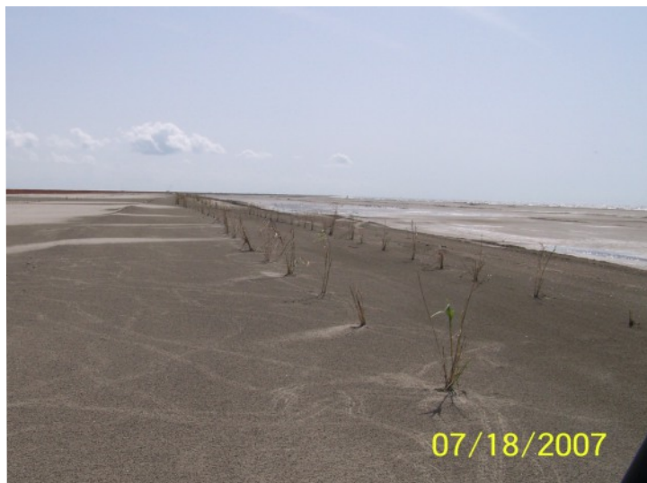
Vegetative plantings and dune features on date of final project inspection.

The Isles Dernieres shoreline is one of the most rapidly deteriorating barrier shorelines in the United States. This barrier system is exhibiting a pattern of fragmentation and disintegration. With regard to longshore sediment transport systems or the movement of beach material by waves and currents, the islands have ultimately become sources of sediment themselves leading to an ever-decreasing volume of sediment.