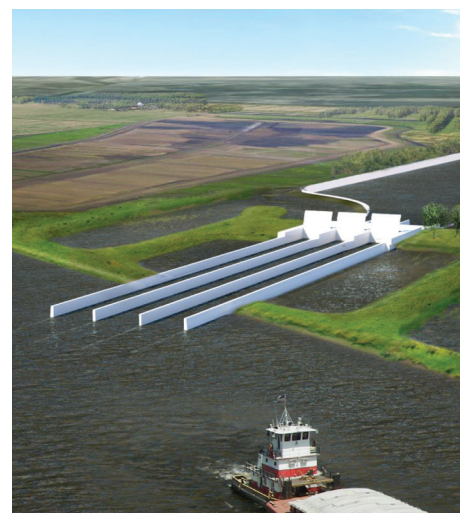
Conceptual design of a sediment diversion.

Sediment diversions allow us to use the energy of the river to capture and push sediment out into the basin. The water will move through the wetlands, leaving sediment behind that will build land over time. These new and sustained wetlands can provide natural habitat and a buffer from storm surge for communities and industry.