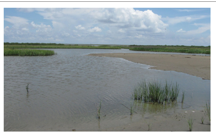
Dredge material from the Gulf of Mexico will be pumped into the project area to create 210 acres of back barrier marsh and nourish 175 acres of emergent marsh behind 3.5 miles of the Caminada beach.

The goals of this project are to: 1) Create and/or nourish 385 acres of back barrier marsh, by pumping sediment from an offshore borrow site; 2) Create a platform upon which the beach and dune can migrate, reducing the likelihood of breaching, improving the longevity of the barrier shoreline, and protecting wetlands and infrastructure to the north and west. The proposed project is expected to slow the current trend of degradation in the headland.